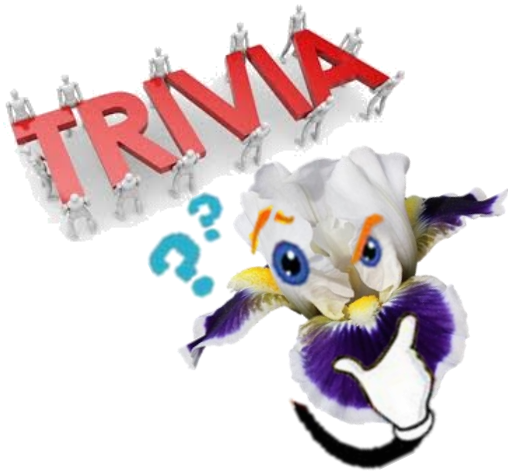
Median Iris Society #1 Complete the crossword below