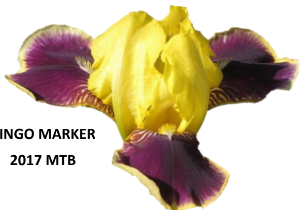
BINGO MARKER 2017 MTB