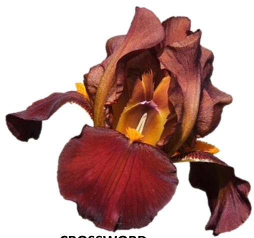
CROSSWORD 2017 SDB